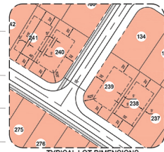
TYPICAL LOT DIMENSIONS & SETBACKS